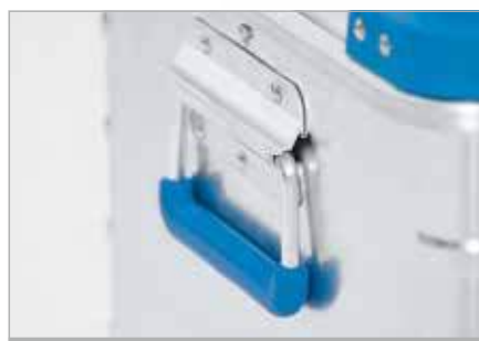
Ergonomic ZARGES Comfort handle for loads of up to 50 kg