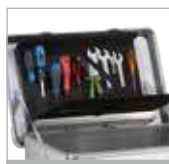
40630 Lid bag, self-adhesive Page 31