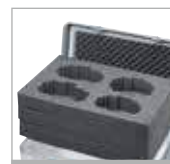
40735-40737 Pick 'n' Pluck foam set Page 31