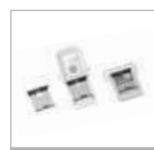
40834 Spring anti-opening feature Page 31