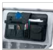
40626 Attaché insert Page 31