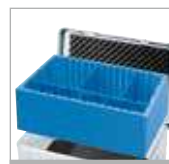
40730 Divider panel system Page 31