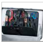
40627 Tool bag Page 31