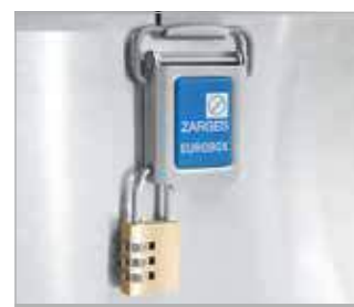
Fastener with clip and shackle lock