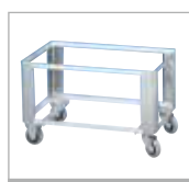
40680 W 152 dolly trolley Page 31