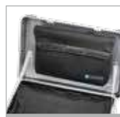
41820 Lid bag Page 31