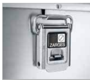
Fastener with spring anti-opening feature