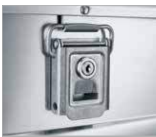
Fastener with plug lock

The ZARGES Comfort fasteners can be equipped with a mortise lock or with catch spring retention (anti-opening feature). They can also be secured with a shackle lock or lead seal.