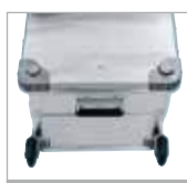
40738 Add-on castors Page 31