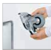
40741, 40742 Clip-on castors Page 31