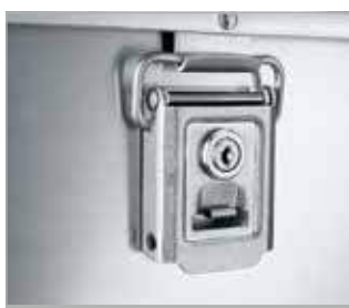
Fastener with catch spring retention (anti-opening feature) and plug lock