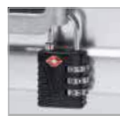
46789 TSA shackle lock Page 31