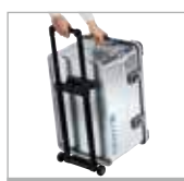
40739 Trolley Page 31