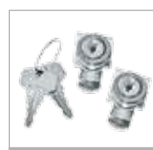
40832, 40833 Lock set Page 31