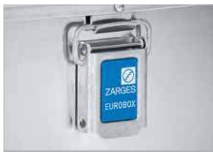
ZARGES Comfort fastener with extremely long service life

The sturdy and lightweight transportation and storage solution with distinctive blue corners and a comprehensive range of accessories.