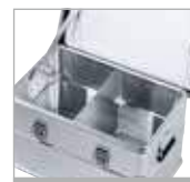
40864-40866 Adjustable aluminium divider set Page 31